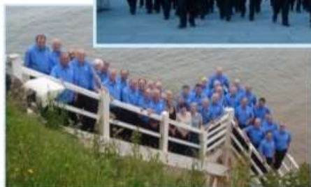
Jacob's Ladder Sidmouth Devon