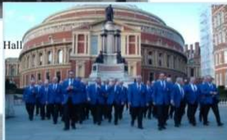
Royal Albert Hall London