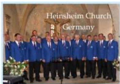
Heinsheim Church Germany

Our more modern pieces include You Raise Me Up , An American Trilogy and Hallelujah as well as songs from the shows such as I Dreamed a Dream .