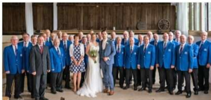
Members of the Choir with a happy bride and groom after their wedding

In addition to a weekly meeting for rehearsals we regularly perform at venues throughout our area - charity concerts, weddings and other social gatherings. We also enjoy excellent support from wives and partners at these events and when we travel on tours. The Choir's diary of events is always available to view on our website www.builthmalechoir.org.uk .