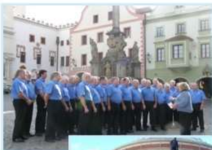
Cesky Krumlov Czech Republic

The Choir goes on tour throughout Britain and to many international destinations. We have also established links with other choirs from other parts of Britain and in Germany and the USA.